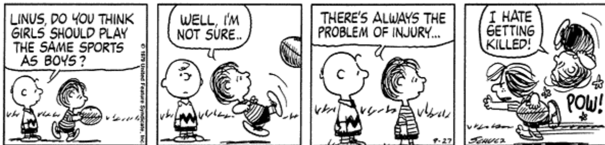
Peanuts—September 27, 1979

If you would like any of the images from Leveling the Playing Field to print in a publication, contact Gina Huntsinger at gina@schulzmuseum.org or (707) 284-1268.