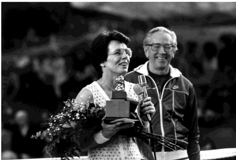
Charles M. Schulz standing with Billie Jean King at the Snoopy Cup tennis tournament at the Redwood Empire Ice Arena in 1984

In 1990 Schulz said, "I think Billie Jean King would certainly have to be in my top three as one of my heroes. She did so much for women's sports. And she's such a bright lady and so involved in everything she's done."