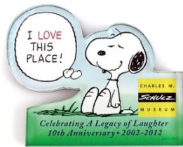
10th Anniversary Magnet, $6.95