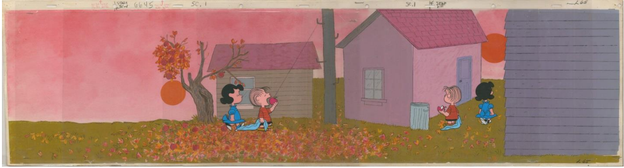
Animation cel from television special It's the Great Pumpkin, Charlie Brown . Copyright line: Peanuts © 1966 Peanuts Worldwide LLC