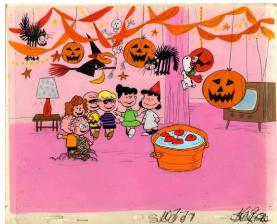
Animation cels from television special It's the Great Pumpkin, Charlie Brown , first broadcast on October 27, 1966. Copyright line: Peanuts © 1966 Peanuts Worldwide LLC