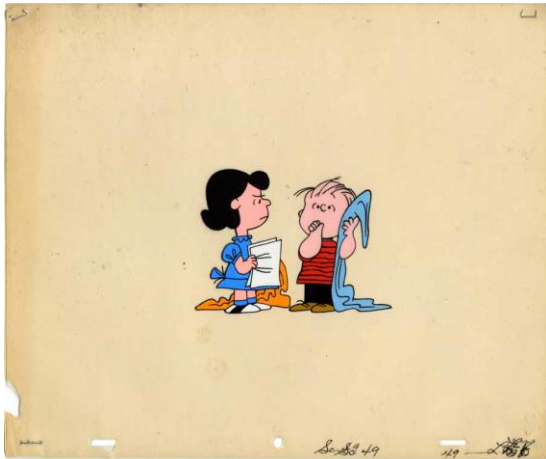
Rare animation cel from television special A Charlie Brown Christmas first broadcast on December 9, 1965. Copyright line: Peanuts © 1965 Peanuts Worldwide LLC