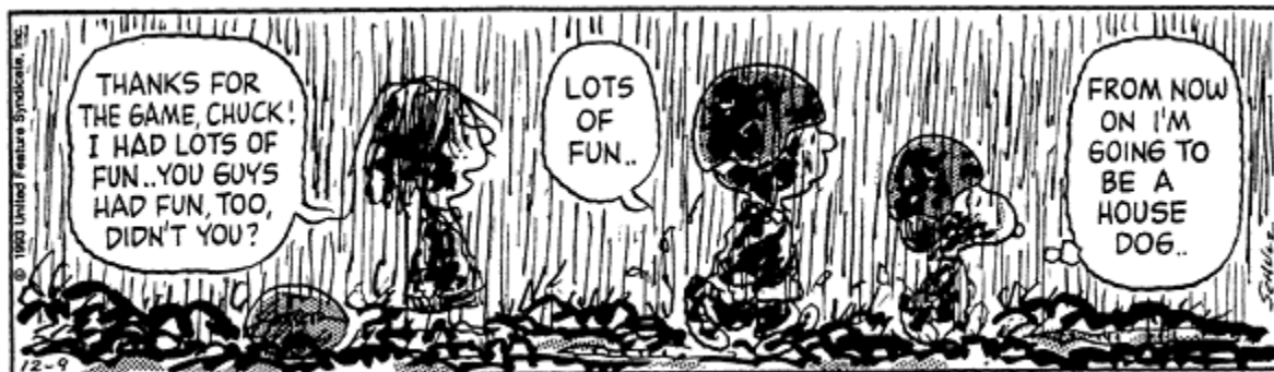
Peanuts©1993 Peanuts Worldwide LLC