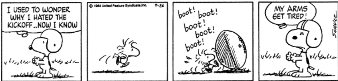
Peanuts©1984 Peanuts Worldwide LLC