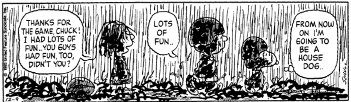
Peanuts©1993 Peanuts Worldwide LLC