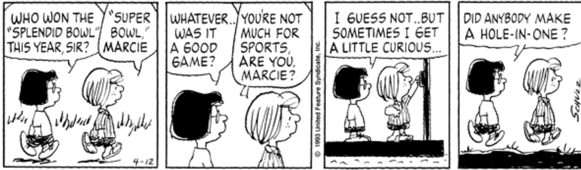
Peanuts©1993 Peanuts Worldwide LLC