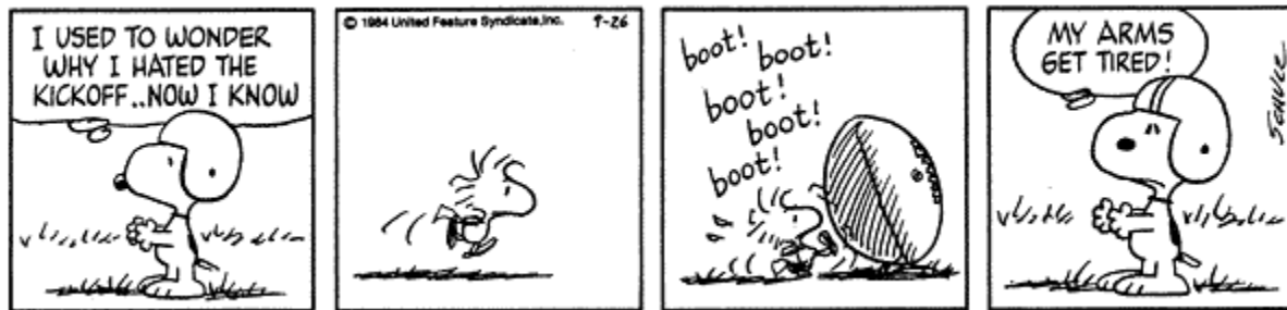
Peanuts©1984 Peanuts Worldwide LLC