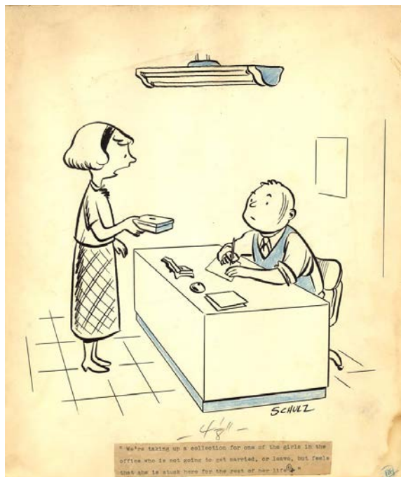
Pre-Peanuts strip created by Schulz reads, "We're taking up a collection for one of the girls in the office who is not going to get married, or leave, but feels that she is stuck here for the rest of her life."

The Outstanding Cartoonist of the Year award is chosen by a secret ballot of the members of the National Cartoonists Society. Informally known as the 'Reuben' and named after Pulitzer Prize-winning cartoonist, Rube Goldberg, this prestigious professional accolade represents the highest honor bestowed annually by the National Cartoonists Society. Schulz was awarded a second Reuben in 1964.