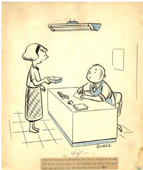
Pre-Peanuts strip created by Schulz reads, "We're taking up a collection for one of the girls in the office who is not going to get married, or leave, but feels that she is stuck here for the rest of her life."

The Outstanding Cartoonist of the Year award is chosen by a secret ballot of the members of the National Cartoonists Society. Informally known as the 'Reuben' and named after Pulitzer Prize-winning cartoonist, Rube Goldberg, this prestigious professional accolade represents the highest honor bestowed annually by the National Cartoonists Society. Schulz was awarded a second Reuben in 1964.