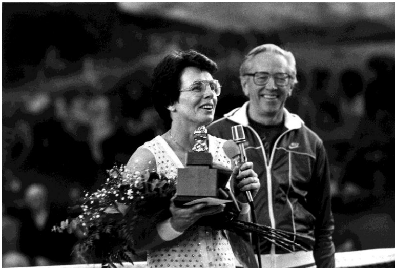
Charles M. Schulz standing with Billie Jean King at the Snoopy Cup tennis tournament at the Redwood Empire Ice Arena in 1984

In 1990 Schulz said, "I think Billie Jean King would certainly have to be in my top three as one of my heroes. She did so much for women's sports. And she's such a bright lady and so involved in everything she's done."