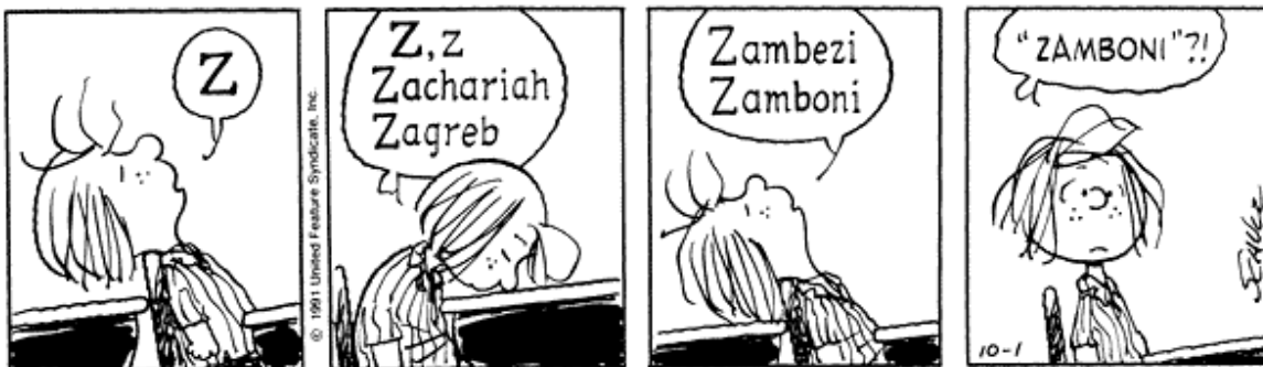
(October 1, 1991) © 1991 Peanuts Worldwide LLC