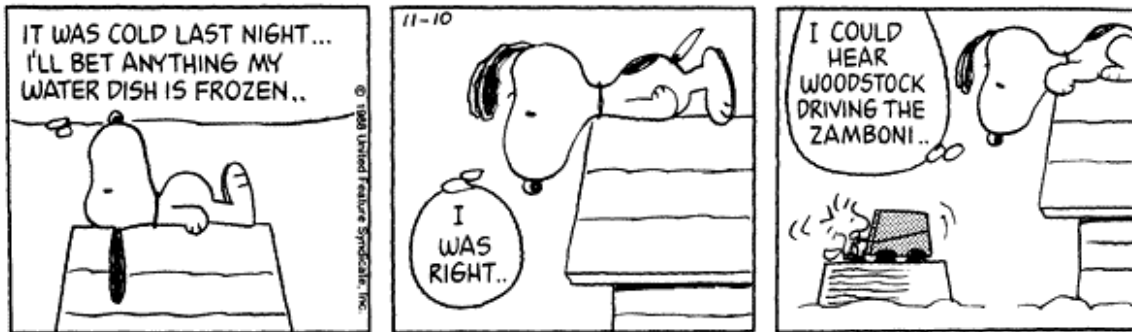
(November 10, 1988) © 1988 Peanuts Worldwide LLC