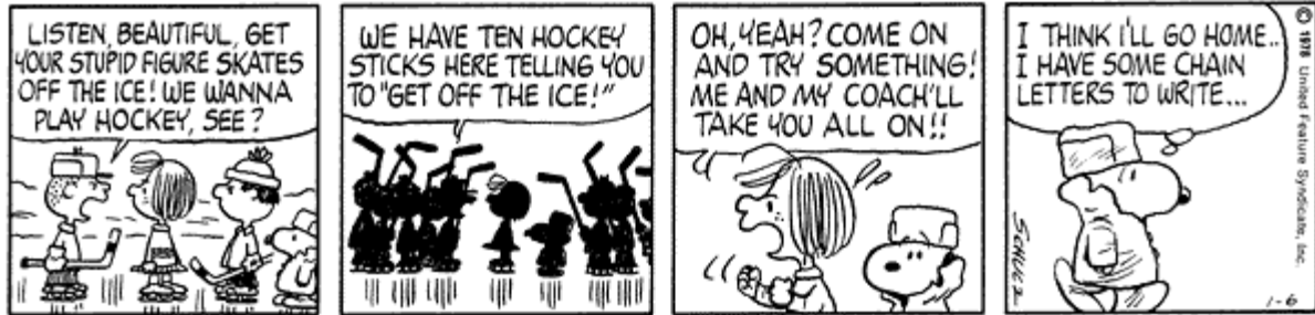
(January 6, 1978) © 1978 Peanuts Worldwide LLC