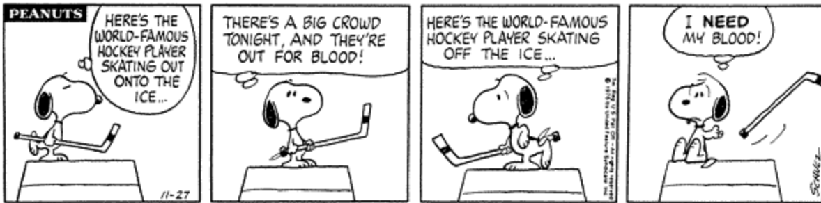
(November 27, 1976) © 1976 Peanuts Worldwide LLC