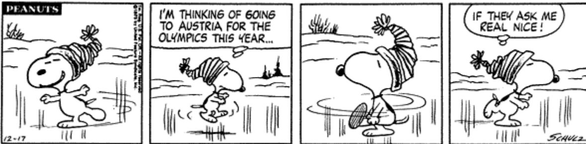
(December 17, 1975) © 1975 Peanuts Worldwide LLC