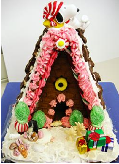
Snoopy Gingerbread Doghouse 2013.

Assemble and decorate Snoopy's doghouse out of gingerbread complete with a marshmallow Snoopy on top. Advance reservations required. To register visit us online at www.schulzmuseum.org/learn/classes-camps or call us at (707) 284-1263.