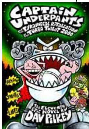
Captain Underpants Book Cover by Dav Pilkey.

Author and cartoonist Dav Pilkey , creator of the Captain Underpants series, will give two talks about his work, give drawing demonstrations, and sign his newest Captain Underpants book at 10:00 am and 3:00 pm. Pilkey's other work include numerous popular, award-winning books for children, such as Dog Breath , winner of the California