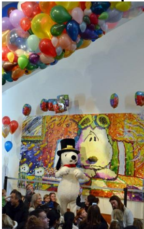
Schulz Museum New Year's Ball Drop 2013