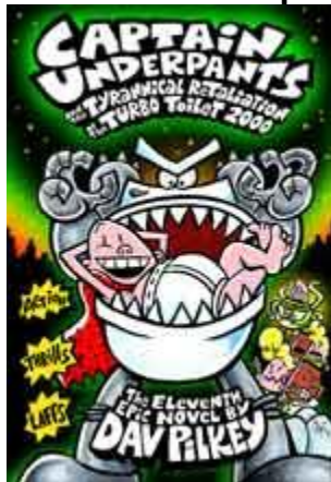
Captain Underpants Book Cover by Dav Pilkey.

Author and cartoonist Dav Pilkey , creator of the Captain Underpants series, will give two talks about his work, give drawing demonstrations, and sign his newest Captain Underpants book at 10:00 am and 3:00 pm. Pilkey's other work include numerous popular, award-winning books for children, such as Dog Breath , winner of the California