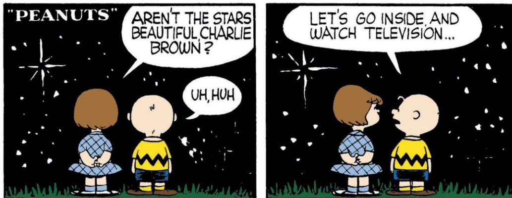
Detail from Peanuts August 3, 1955 © 1955 PNTS