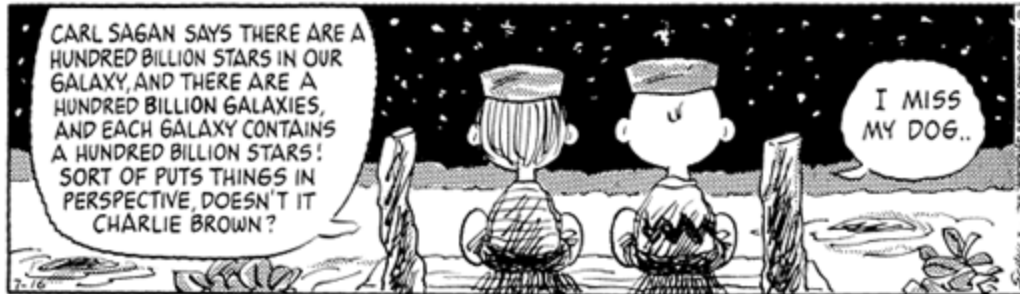
Schulz was a great fan of Carl Sagan, who did much to popularize science with his books and television specials which Schulz unfailingly watched.