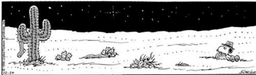
Schulz returned to night sky strips late in his career with compelling cartoons featuring Lonely Spike surveying the crystal clear night skies of his desert home. This strip was published on Christmas Eve 1996.