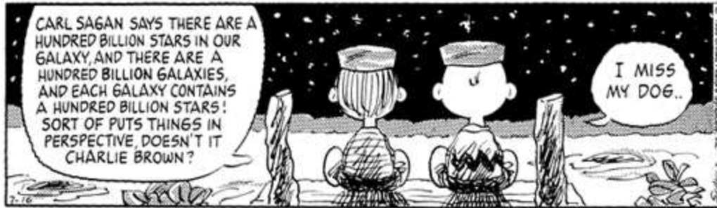
Schulz was a great fan of Carl Sagan, who did much to popularize science with his books and television specials which Schulz unfailingly watched.