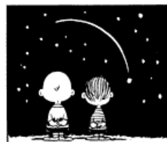
Detail from Peanuts April 19, 1968 © 1968 PNTS