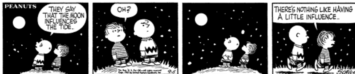
(September 5, 1957) © 1957 Peanuts Worldwide LLC