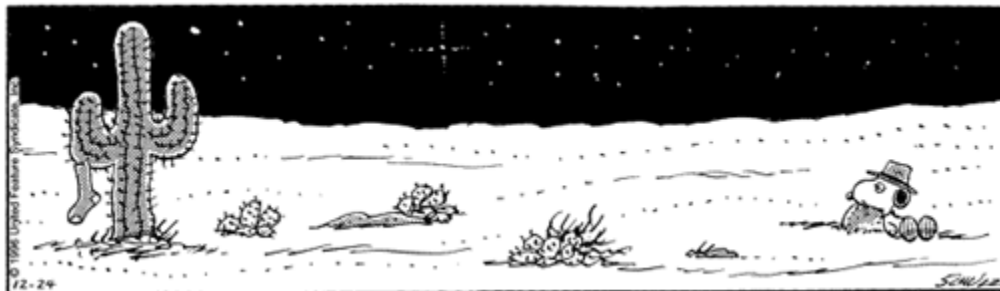
Schulz returned to night sky strips late in his career with compelling cartoons featuring Lonely Spike surveying the crystal clear night skies of his desert home. This strip was published on Christmas Eve 1996.