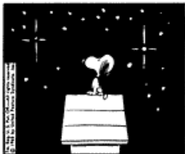
Detail from Peanuts February 27, 1965