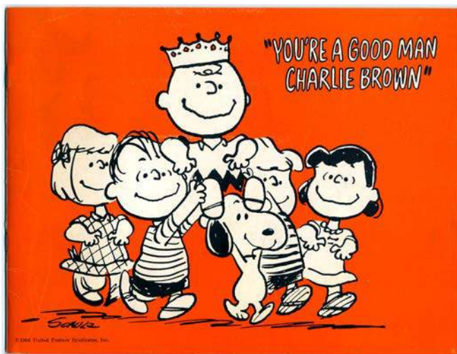
You're a Good Man, Charlie Brown Promotional Booklet, 1966.

FOR IMMEDIATE RELEASE: February 15, 2017