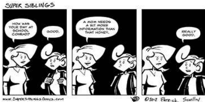
Art by Patrick Scullin from weekly web comic, Super Siblings .

Saturday, January 28, 10:00 am - 4:00 pm