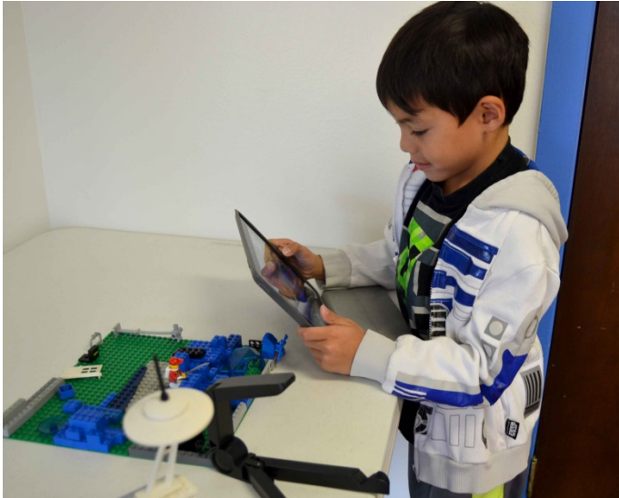
A young boy creates an animated LEGO movie at one of the Museum's classes for kids.