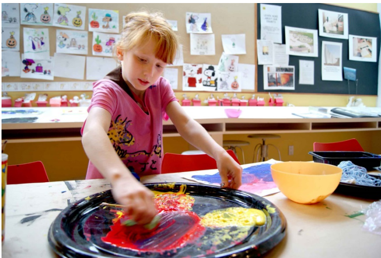
A Girl Scout works on an art project at the Schulz Museum.

Art abounds at the Schulz Museum with hands-on activities focused on the Girl Scout Artist badges. Brownies will paint with sticks and twigs and use color in new ways. Juniors will experiment with different materials, techniques, and perspectives. Cadettes will work on their comic artist badge and Daisies will get started on their Inspired by Animals Journey . Also meet live artists and cartoonists, ice skate at Snoopy's Home Ice, and earn a Schulz Museum Fun Patch. Advance reservations are required. For fees and reservations, visit the Girl Scouts of Northern California website or call (707) 544-5472.