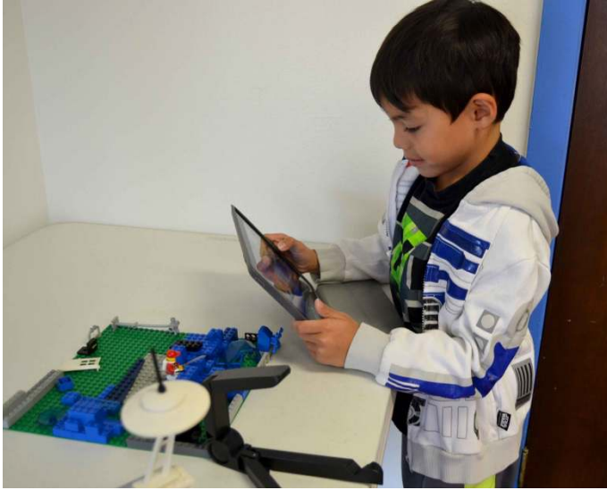
A young boy creates an animated LEGO movie at one of the Museum's classes for kids.