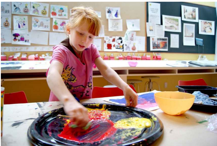
A Girl Scout works on an art project at the Schulz Museum.

Art abounds at the Schulz Museum with hands-on activities focused on the Girl Scout Artist badges. Brownies will paint with sticks and twigs and use color in new ways. Juniors will experiment with different materials, techniques, and perspectives. Cadettes will work on their comic artist badge and Daisies will get started on their Inspired by Animals Journey . Also meet live artists and cartoonists, ice skate at Snoopy's Home Ice, and earn a Schulz Museum Fun Patch. Advance reservations are required. For fees and reservations, visit the Girl Scouts of Northern California website or call (707) 544-5472.