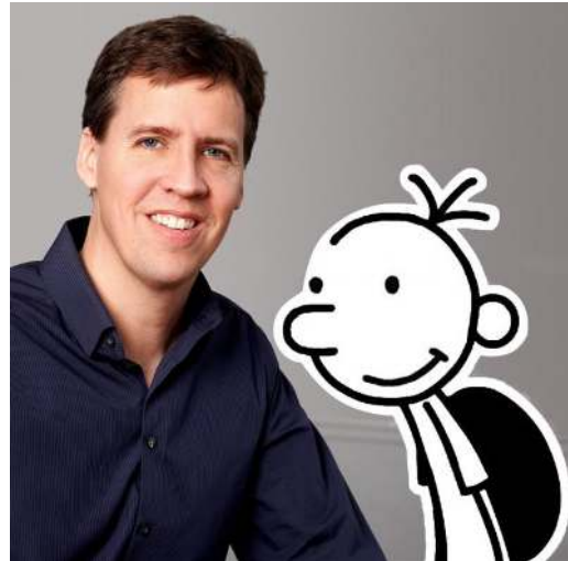
Author Jeff Kinney and his main character Greg Heffley