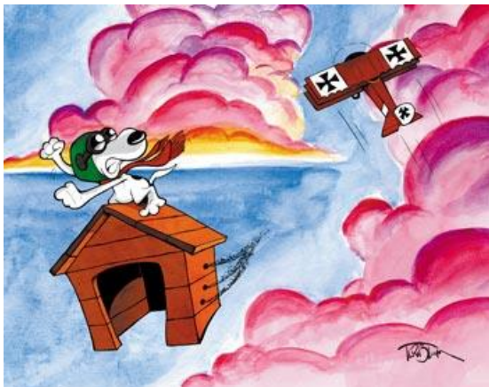
Tribute art by Lucas Turnbloom