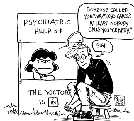
Tribute art by Paige Braddock