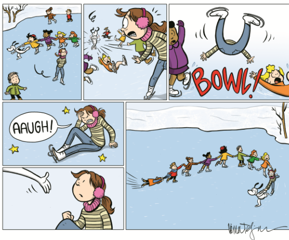
Tribute art by Raina Telgemeier