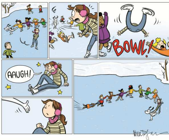
Tribute art by Raina Telgemeier