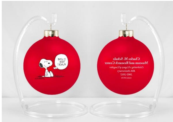
10th Anniversary Ornament, $11.95

Exclusively made tenth anniversary products are available online at http://shop.schulzmuseum.org or in the Museum's store while supplies last.