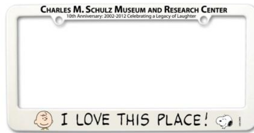
10th Anniversary License Plate Frame, $9.95