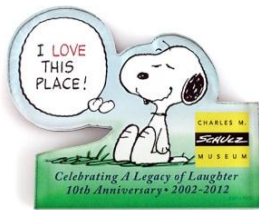
10th Anniversary Magnet, $6.95