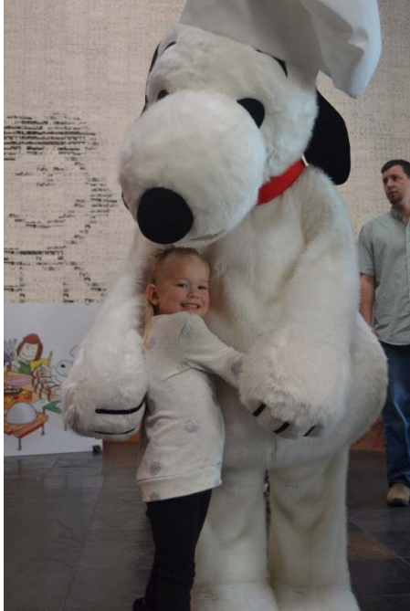
Snoopy greets one of the guests to the feast.

Starting at 1:00 pm on November 19, enjoy a re-creation of Snoopy's Thanksgiving meal of toast, popcorn, pretzels, and jelly beans from the classic television holiday special, along with visits from Snoopy himself and hands-on crafts. Visitors can also enjoy viewings of the Thanksgiving animated special, which will play continuously throughout the afternoon. View our YouTube video of last year's feast .