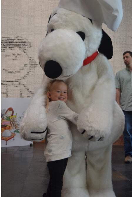
Snoopy greets one of the guests to the feast.

Starting at 1:00 pm on November 19, enjoy a re-creation of Snoopy's Thanksgiving meal of toast, popcorn, pretzels, and jelly beans from the classic television holiday special, along with visits from Snoopy himself and hands-on crafts. Visitors can also enjoy viewings of the Thanksgiving animated special, which will play continuously throughout the afternoon. View our YouTube video of last year's feast .