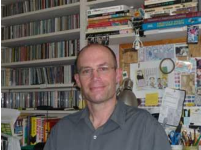
The New York Times Bestselling author and cartoonist, Lincoln Peirce.