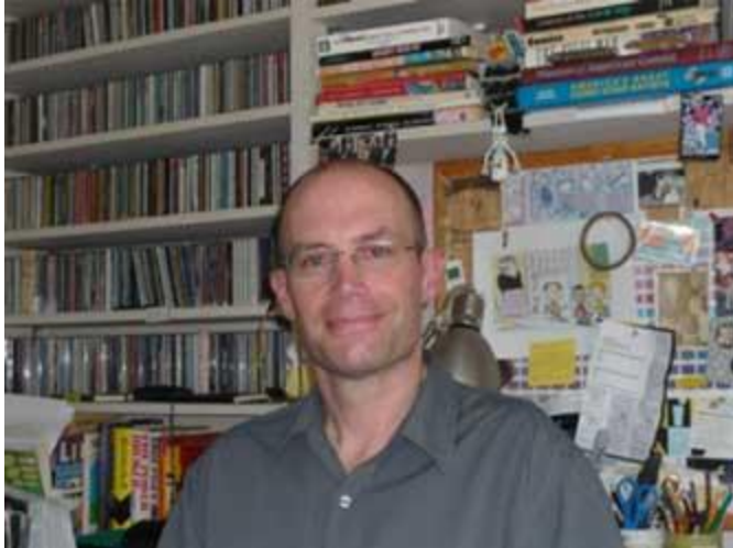
The New York Times Bestselling author and cartoonist, Lincoln Peirce.