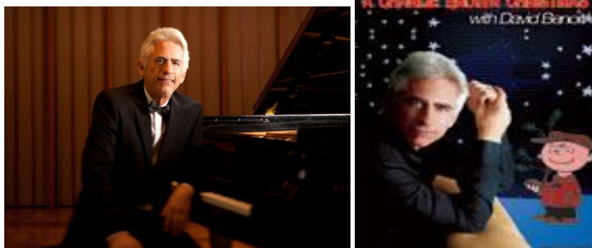
Jazz pianist David Benoit and (right picture) A Charlie Brown Christmas with David Benoit album cover.

at the Charles M. Schulz Museum Saturday, November 3 at 4:00 pm