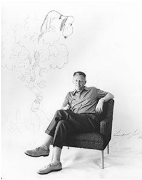
Charles Schulz used model pieces from his home in the Peanuts comic strip.

Sponsors of this exhibition include Herman Miller, IIDA of Northern CA, Trope Group, and Scandinavian Designs.