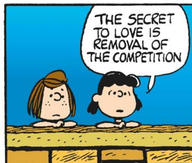
Detail © 1974 Peanuts Worldwide LLC