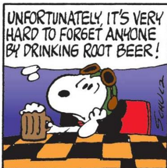
Detail