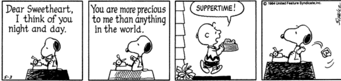
(May 3, 1984) © 1984 Peanuts Worldwide LLC