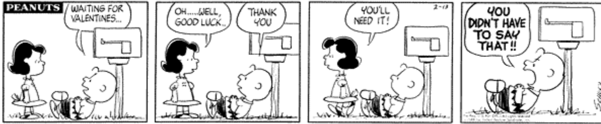
(February 13, 1968) © 1968 Peanuts Worldwide LLC