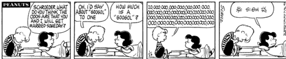
(January 23, 1963) © 1963 Peanuts Worldwide LLC