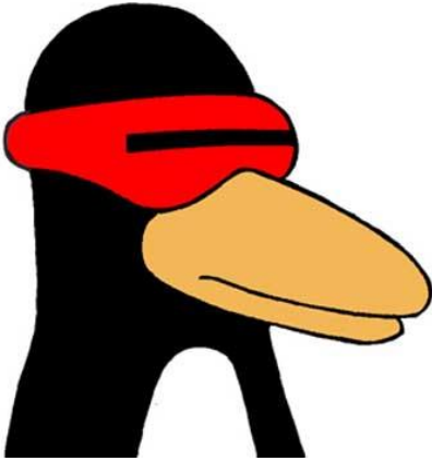
Tom Tomorrow's This Modern World features Sparky, a recurring character in the strip.