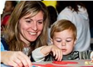
A mother and her young son work together on a craft project at Museum Mondays for Little Ones.

Enjoy stories, movement games, arts and craft activities and a movie on the last Monday of the month. Activities are designed for children ages 1 – 5 and their caregivers. Cost: $5 per child. Up to 2 adults per child are free before 11am. After 11am, regular museum admission applies.