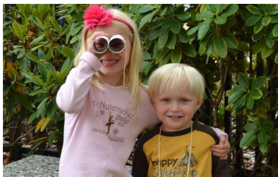
Museum Monday participants create hand-made crafts each Monday through February 23.

Enjoy stories, movement games, arts and craft activities every Monday through February 23. Activities are designed for children ages 1 – 5 and their caregivers. Cost: $5 per child. Up to 2 adults per child are free before 11am. After 11am, regular museum admission applies.