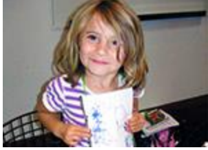
A proud Museum Monday participant shows off her art work.