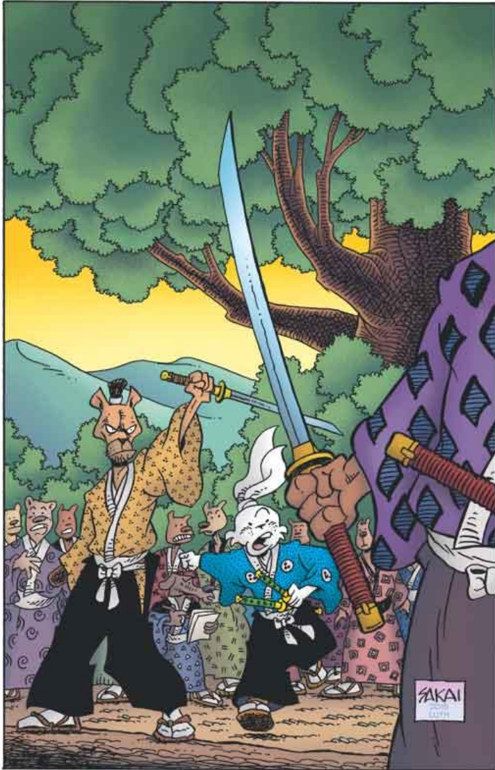
DH USAGI YOJIMBO #148 THE ONE-ARMED SAMURAI