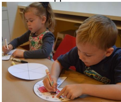
Museum Monday participants create hand-made crafts each Monday through February 29.

Enjoy stories, movement games, and arts and craft activities EVERY Monday through February 29. Activities are designed for children ages 1 – 5 and their caregivers. Cost: $5 per child. Up to 2 adults per child are free before 11am. After 11am, regular museum admission applies.