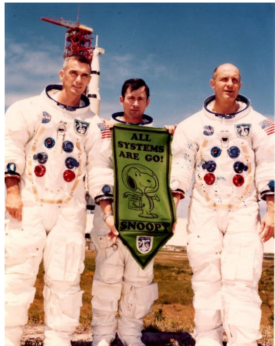
Apollo 10 astronauts (L-R) Eugene Cernan, John W. Young, and Thomas Stafford hold a banner featuring Snoopy, May 1969.

Visit schulzmuseum.org for more details. Event is included with museum admission.