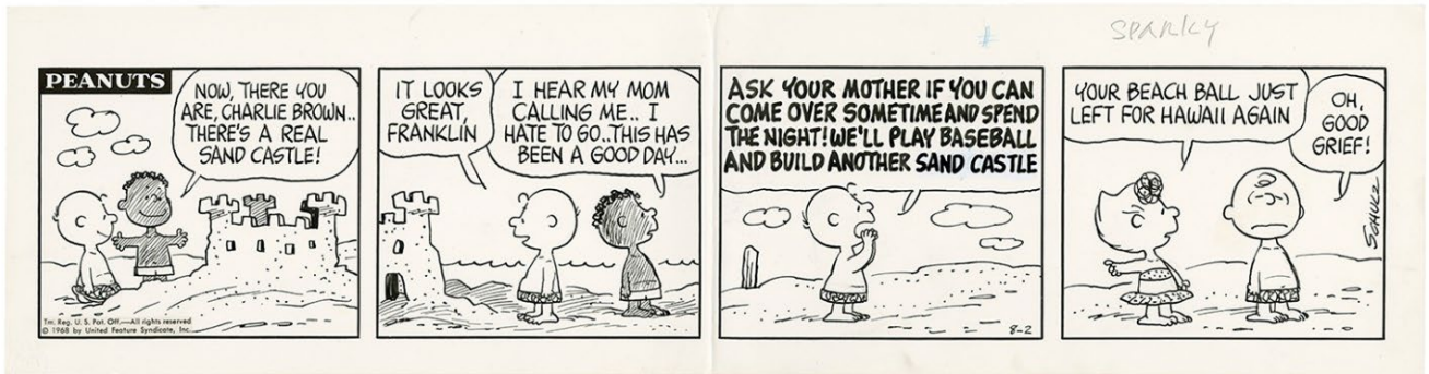
Scan of original Peanuts comic strip, August 2, 1968, featuring Charlie Brown, Franklin, and Sally. From the collection of the Charles M. Schulz Museum, Santa Rosa, CA.