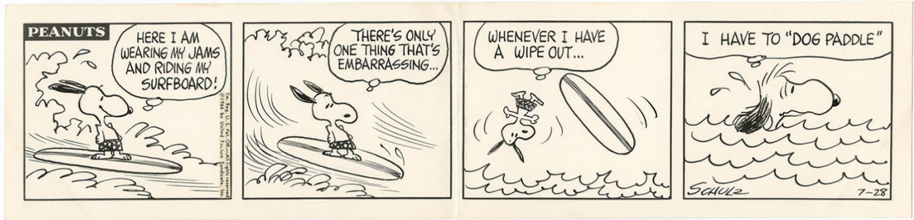
Scan of original Peanuts comic strip, July 28, 1966.