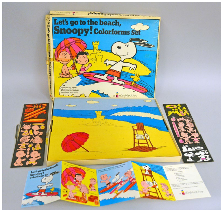
Licensed Peanuts products from the collection of the Charles M. Schulz Museum, Santa Rosa, CA. Left: © Determined Productions/PNTS. Right: © 1973 Colorforms, Inc./PTNS