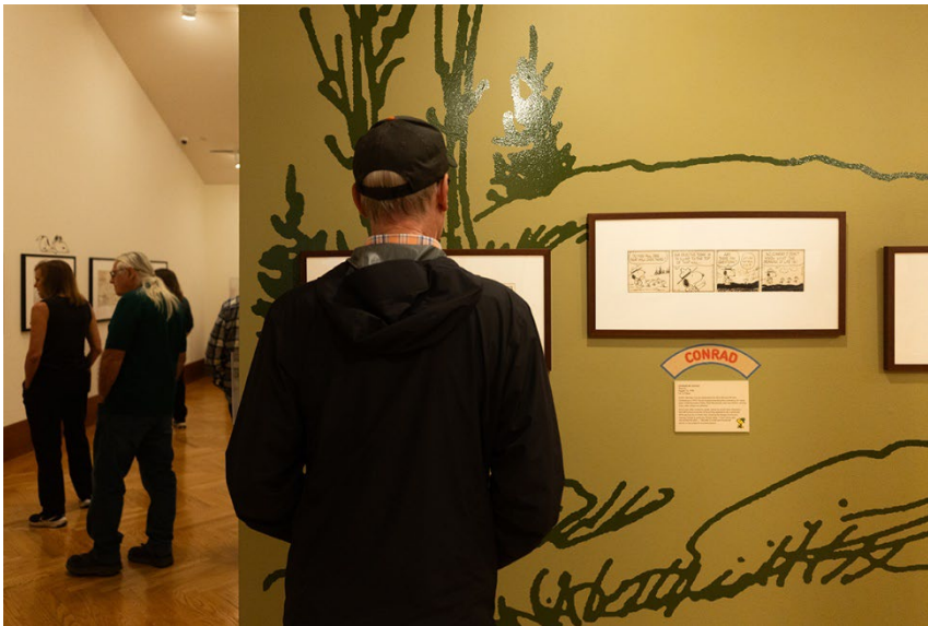
A section titled "Meet the Troop" provides an introduction for each named member of Snoopy's Beagle Scout troop: Woodstock, Bill, Conrad, Harriet, Raymond, Fred, Olivier, Roy, and Wilson.