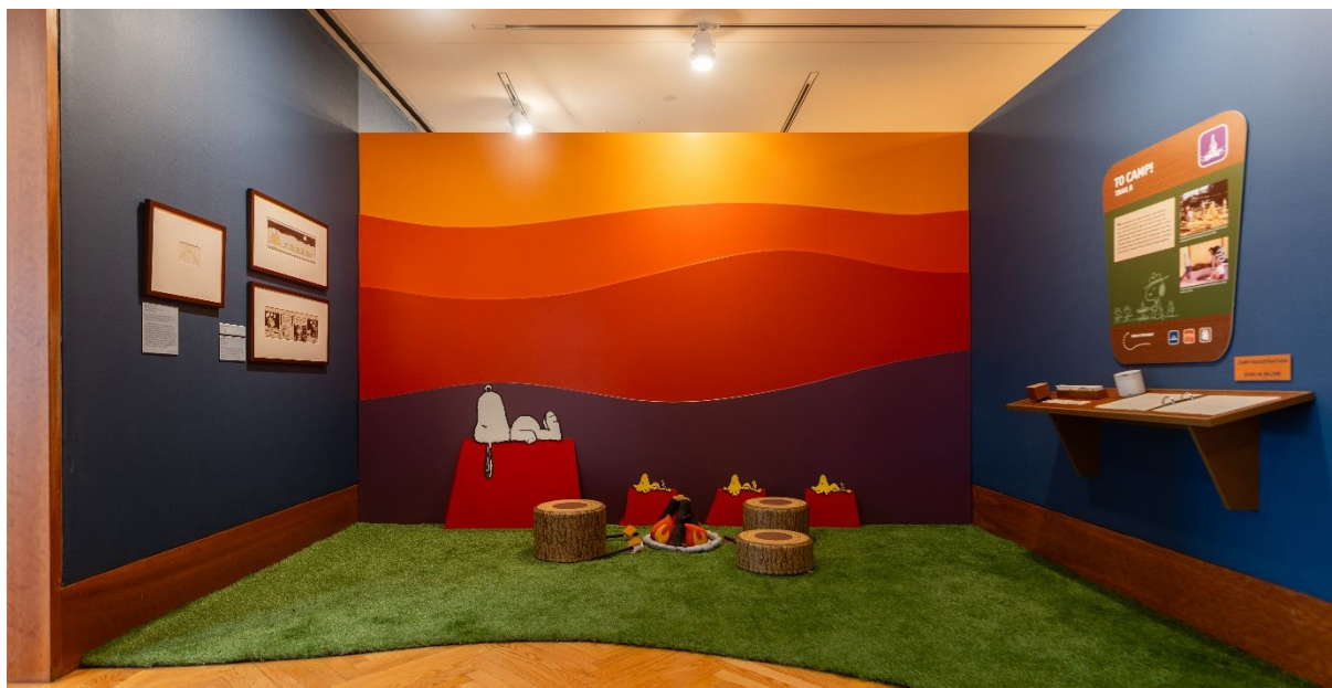
A campfire photo op provides an opportunity for visitors to camp out with Snoopy.