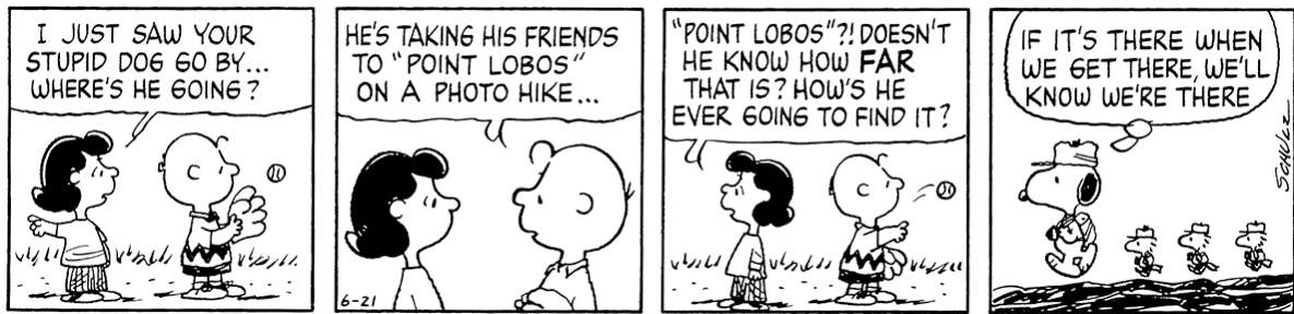
The Beagle Scouts visit some of the places Charles Schulz visited for day hikes and enjoying the outdoors, including Point Lobos in Monterey County, as seen in this Peanuts comic strip from June 21, 1983. © Peanuts Worldwide LLC