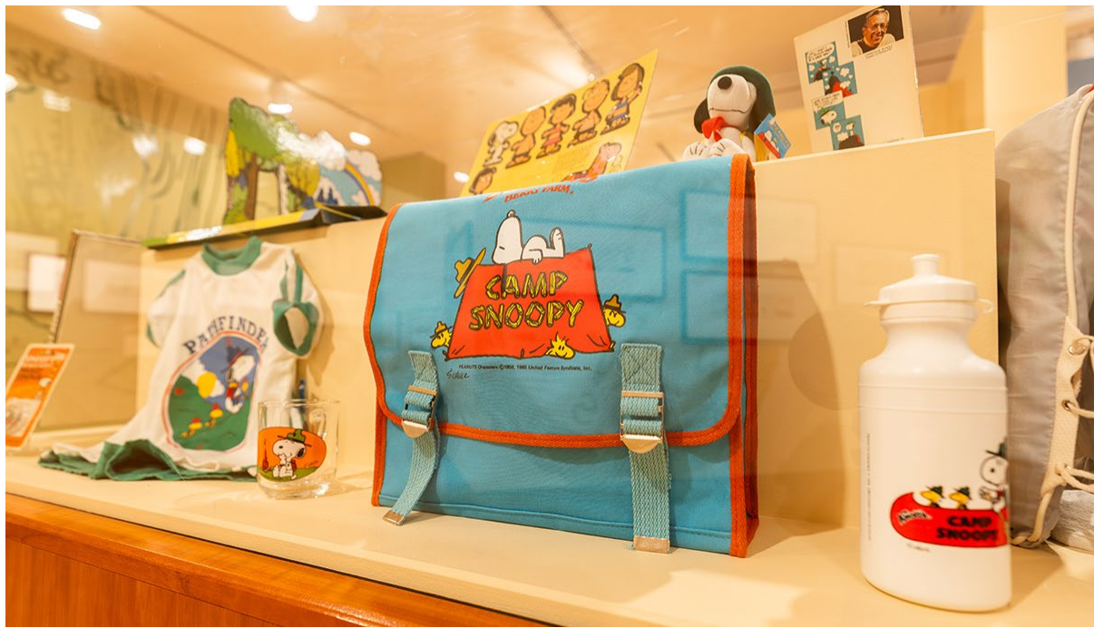
One of several display cases featuring Beagle Scout products dating back to the 1970s.