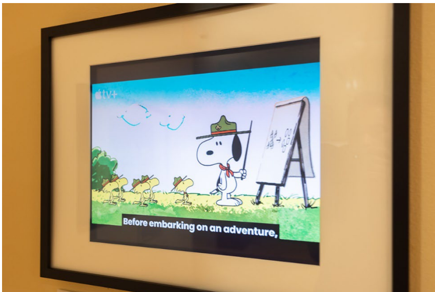
An animation station plays clips from The Charlie Brown and Snoopy Show (1983) and Camp Snoopy (2024, AppleTV+).