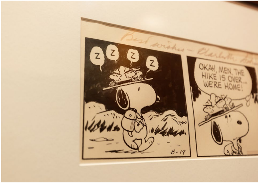
Over 30 original Peanuts comic strips from the Schulz Museum's collection are on display.