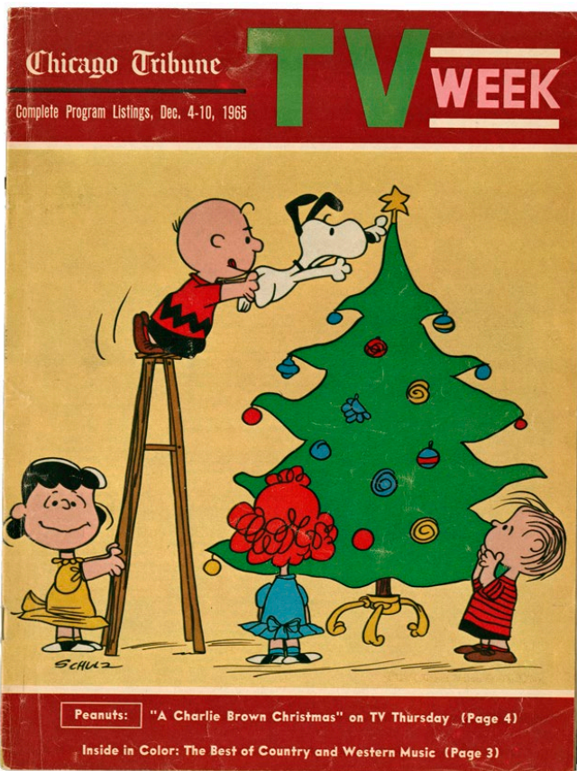
TV Week from the Chicago Tribune, December 4-10, 1965, with an announcement of the December 9, 1965, air date of A Charlie Brown Christmas on the cover.